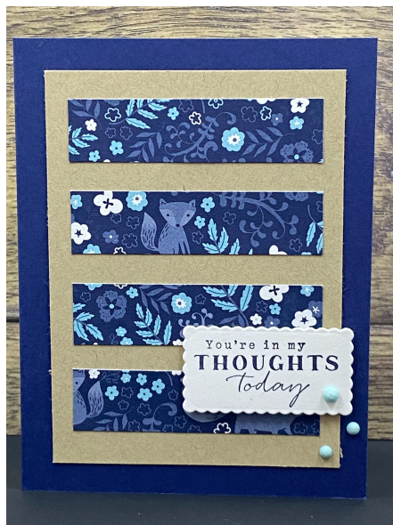
Two different solids