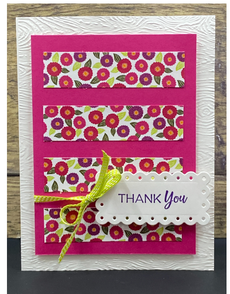
Solid on textured white