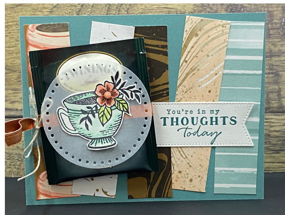
Add a tea bag on top!