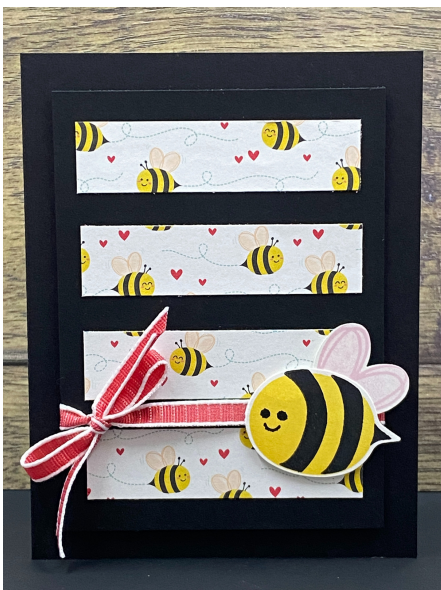
Black on Black