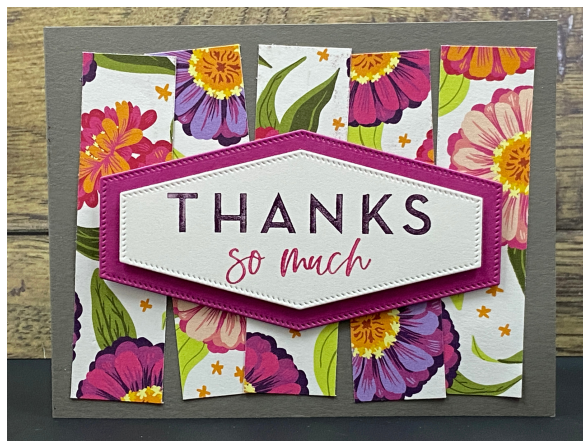
(5) 1" x 3-3/4" panel strips askew