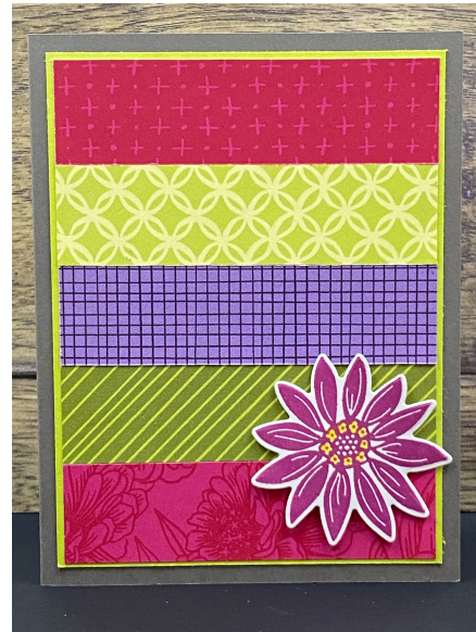
3-7/8" x 5-1/8" layer under strips