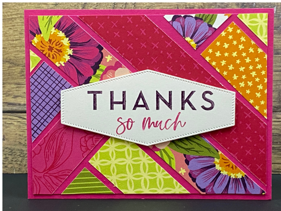
1" strips of varying length in Quilt Strip Technique