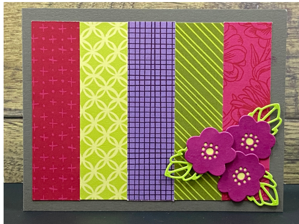
(5) 1" x 3-3/4" panel strips touching each other